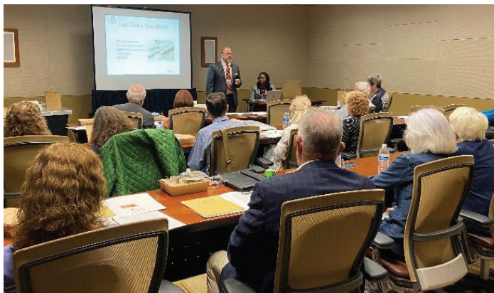
Estate and Personal Planning Seminar, Phoenix, Arizona